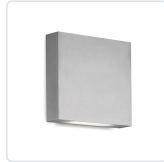
AT67006-BN Brushed Nickel