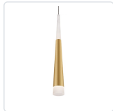
402501BG-LED Brushed Gold