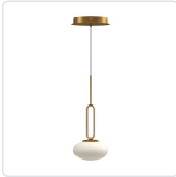
PD29806-BG Brushed Gold