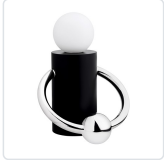
TL73708-MB/CH Matte Black/Chrome