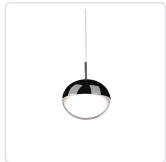
402801BC-LED Black Chrome