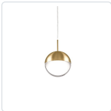
402801BG-LED Brushed Gold