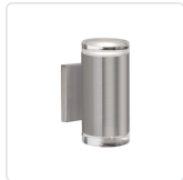
601432BN-LED Brushed Nickel