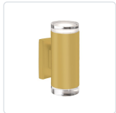
601432BG-LED Brushed Gold