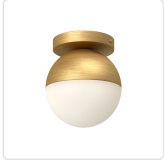
FM58306-BG/OP Brushed Gold/Opal Glass