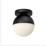
FM58306-BK/OP Black/Opal Glass