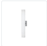
WS8424-BN Brushed Nickel