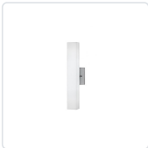
WS8418-BN Brushed Nickel