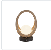
TL20610-BK/OP Black/Opal Matte Glass