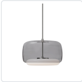
PD70615-SM/BN Smoked/Brushed Nickel