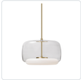
PD70615-CL/BG Clear/Brushed Gold