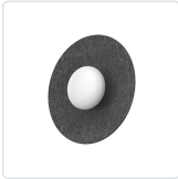
FM22815-GY Felt - Gray