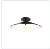
FM22815-BK/WH Metal - Black/White