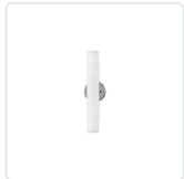
WS8318-BN Brushed Nickel