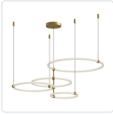
CH24755-BG Brushed Gold