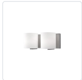
70232BN Brushed Nickel