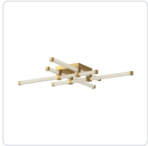
FM23534-BG Brushed Gold