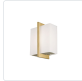
WS39210-BG Brushed Gold