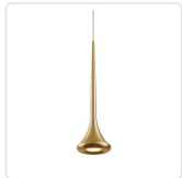
402601BG-LED Brushed Gold