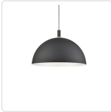
492332-BK/GD Black with Gold detail