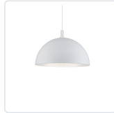
492332-WH/GD White with Gold detail