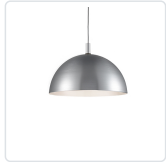
492332-BN/BK Brushed Nickel with Black detail