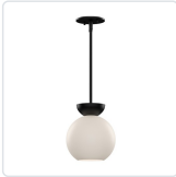
PD59708-BK/OP Black/Opal Glass