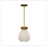
PD59708-BG/OP Brushed Gold/Opal Glass