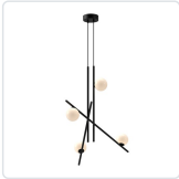
CH89832-BK/GO Black/Glossy Opal Glass