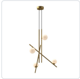
CH89832-BG/GO Brushed Gold/Glossy Opal Glass