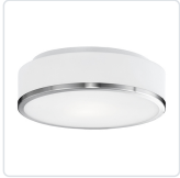
FM6012-BN Brushed Nickel