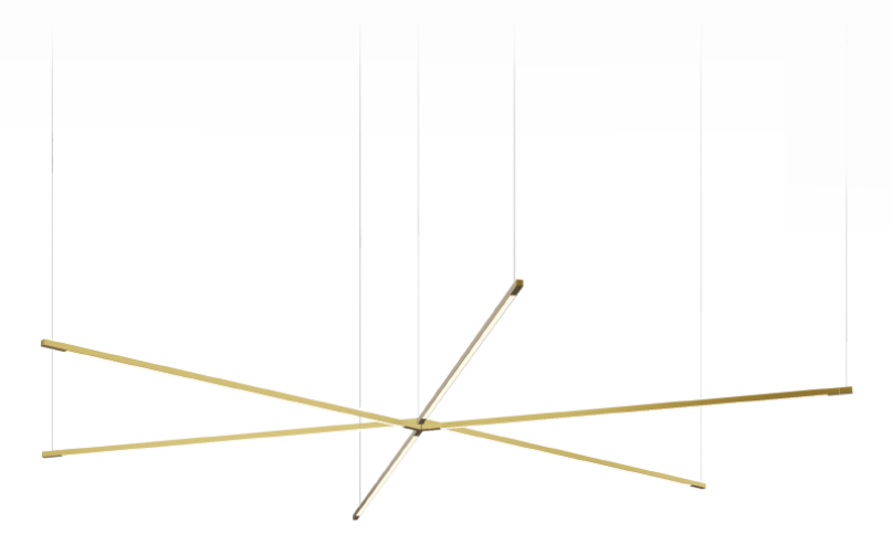
tri-star with 36" light bars