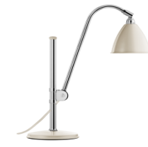
// Off-White / Chrome