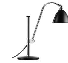
// Black / Chrome