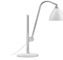
// White / Chrome