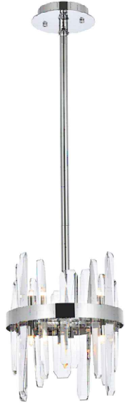
Chrome Item No: 2200D10C

6-Light Chrome Pendant Lamp Clear Crystal