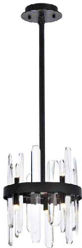
Black Item No: 2200D10BK