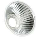
EP735C - EP738C