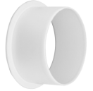
L50W - White Snoot