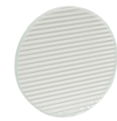
L55 - Double Asymmetric Herculux Lens