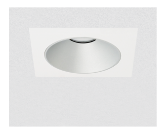
Compatible Trims: Compatible with 4" Pex Trims.