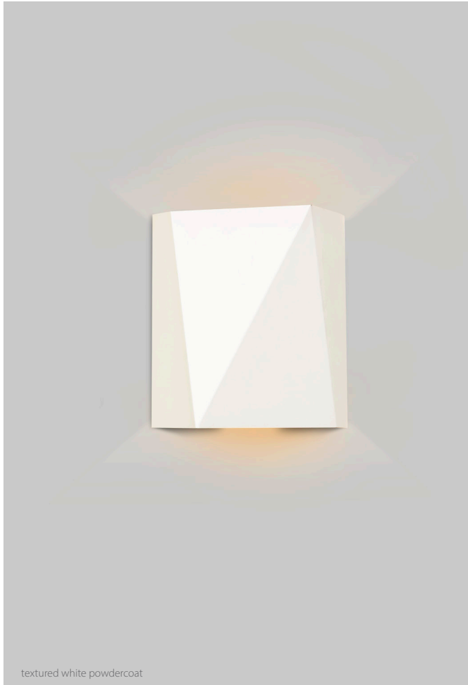
textured white powdercoat