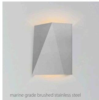
marine grade brushed stainless steel

Cerno's Calx Outdoor sconce is an existing design that we modified to withstand the elements. The materials and components were meticulously designed and engineered to comply and pass UL's wet location requirements.