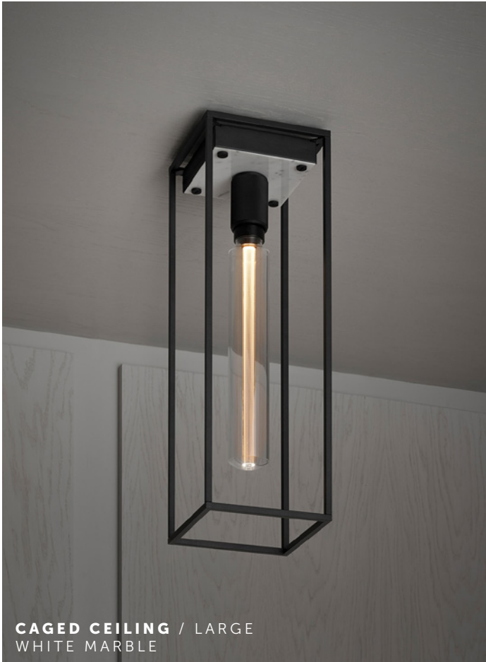
CAGED CEILING / LARGE WHITE MARBLE