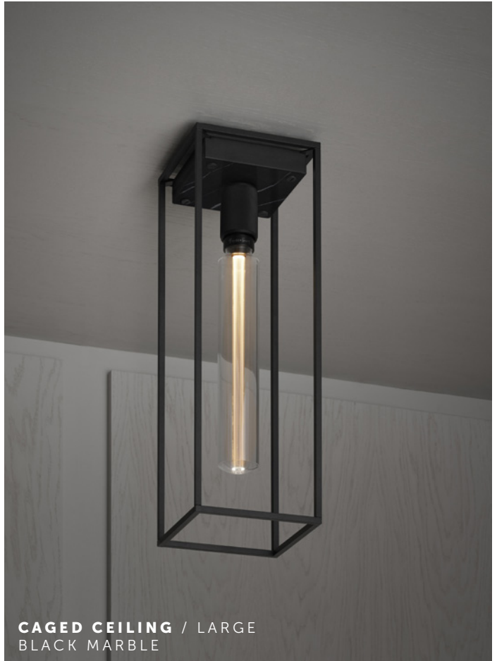
CAGED CEILING / LARGE BLACK MARBLE