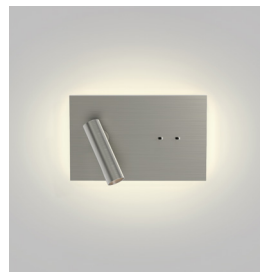
CODE: 1352029 FINISH: MATT NICKEL