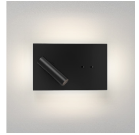
CODE: 1352028 FINISH: MATT BLACK