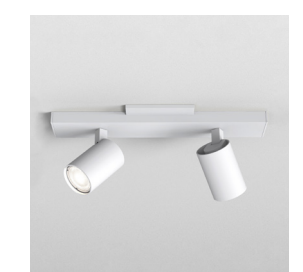
CODE: 1286072 FINISH: TEXTURED WHITE