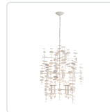
CH340041MW Matte White