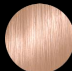
SOFT VANILLA 913