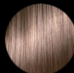
SWEET TOFFEE 834