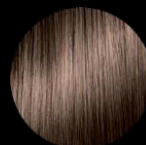
CAFFÈ LATTE 807