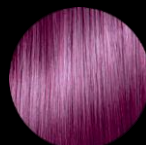
CRAZY VIOLET 681