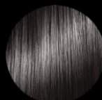
SILVER GREY 911