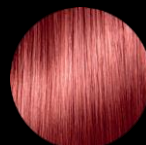
FIRE RED 766