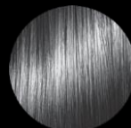
COLD SILVER 1001