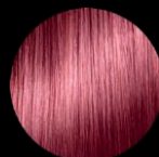
POWER PINK 906