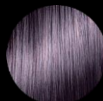
SMOKED LAVENDER 908