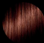
HOT CHOCOLATE 673