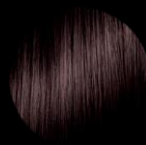
DARK BROWN 471

COLOUR CHART: • 1 – ASH • 3 – GOLDEN • 4 – COPPER • 6 – RED • 7 – BROWN • 8 – VIOLET • 9 – PEARL