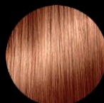
SHINY COPPER 747