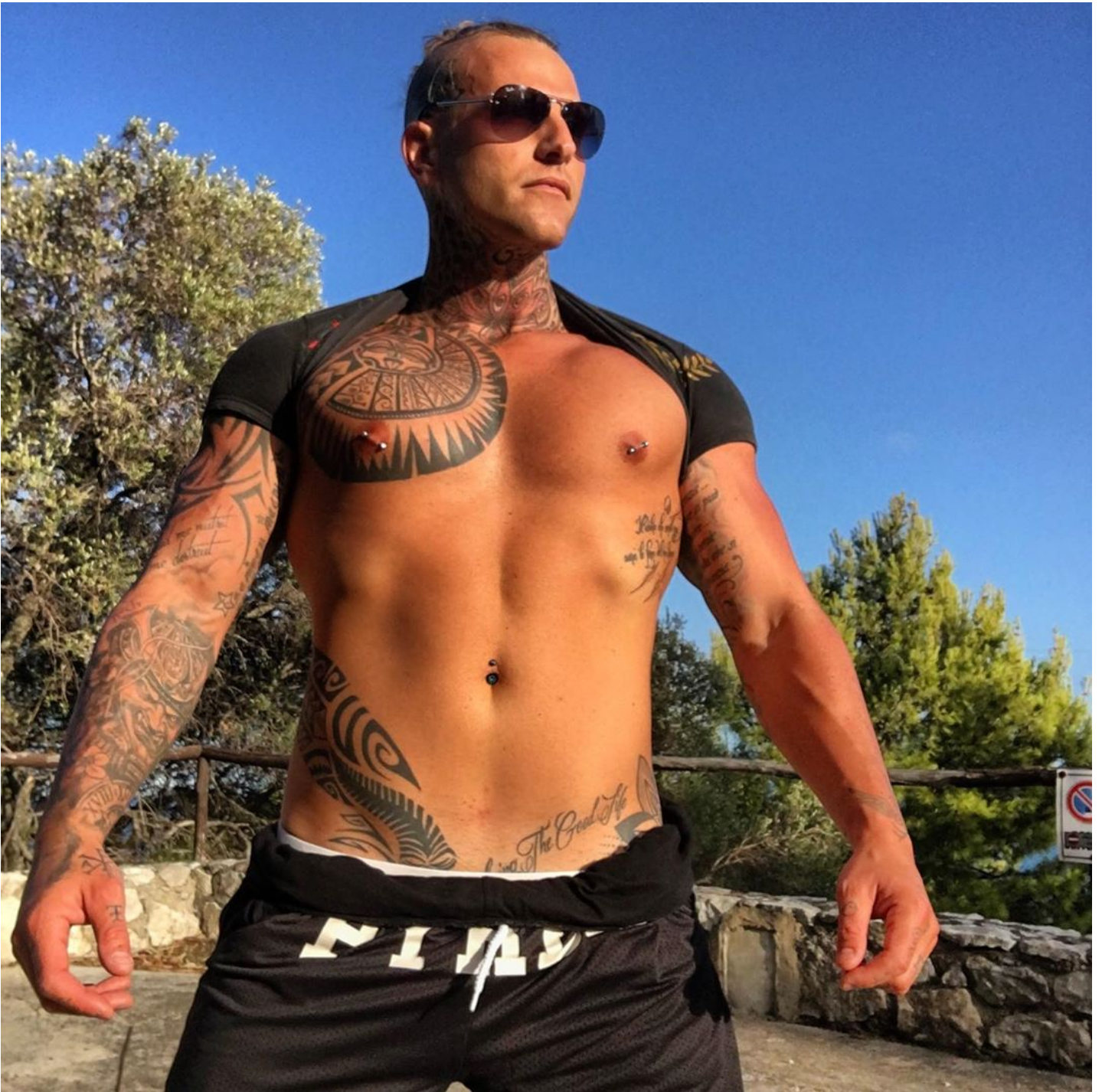
First picture - March 2020 (145 lbs) looking & feeling the best I ever have (still weigh the same now)