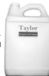
T-8128 Gal. Air Tool Oil