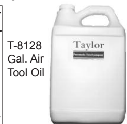
T-8128 Gal. Air Tool Oil

TAYLOR Airtool oil is custom blended to improve the life and performance of airtools. It will emulsify with water to protect against rust, and will loosen and flush out built up sludge and dirt.