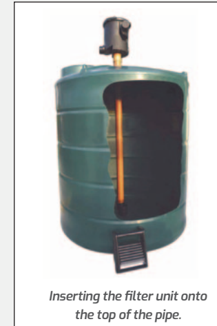
Inserting the filter unit onto the top of the pipe.