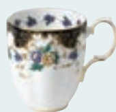
Duchess 1910 Mug 0.4ltr 40017591 701587269667