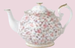
Rose Confetti Teapot 1.25ltr ROSCON25817 652383737129