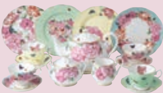
15 Pce Set Teacup, Saucer, Plate 20cm, Teapot, Sugar & Cream 40010668 701587231299