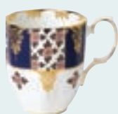
Regency Blue 1900 Mug 0.4ltr 40017576 701587269520