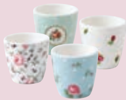
Egg Cups Set of 4 Boxed ROALGW25836 652383736658