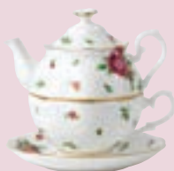
Country Roses White Tea For One NCRWTW12829 652383744073