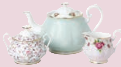
3 Piece set mixed, Teapot, Sugar & Cream – Polka Rose, Rose Confetti, NCR Pink 40034975 701587412469