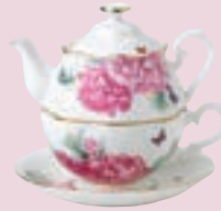
Tea for One Friendship 40005761 701587181112