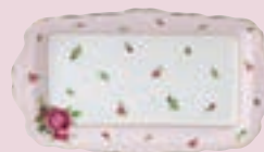
Country Roses Pink Sandwich Tray Boxed NCRPNK26137 652383739390