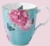
Mug 0.4ltr Turquoise Friendship 40001826 701587018869