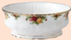
Salad Bowl 26cm IOLCOR 00176 798901568490