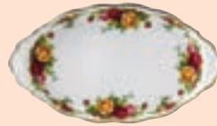
Sugar & Cream Tray 29x17cm IOLCOR 00076 798901567912