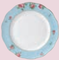
Polka Blue Plate 27cm POLBLU25812 652383736108