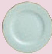
Polka Rose Plate 20cm POLROS25811 652383737013