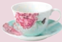
Teacup & saucer Green 40033991 701587396325