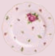
Country Roses Pink Plate 20cm NCRPNK25811 652383736771