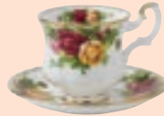
Coffee Cup 0.15Ltr IOLCOR 00135 798901568209