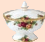
Lidded Box 12cm 40001852 701587018654