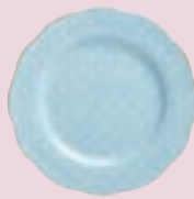
Polka Blue Plate 20cm POLBLU25811 652383736931