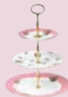
Cheeky Pink Three Tier Cake Stand Boxed CHEPNK26584 652383749917