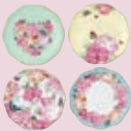
Coasters 10cm Set of 4 40001836 701587018968