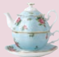
Polka Blue Tea For One POLBLU12829 652383744066