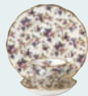
English Chintz 1940 Teacup & Saucer, Plate 20cm 40017568 701587269445