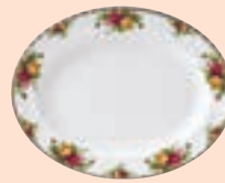
Oval Dish 33cm IOLCOR 00109 798901568070