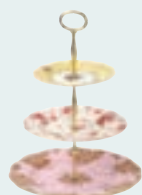
3 Tier Cakestand Bouquet, Golden Roses, Rose Blush 40033954 701587396714