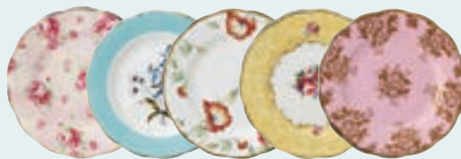
1950-1990 Plate 20cm Box Set of 5 40017562 701587269391