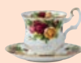
Coffee Cup & Saucer Boxed IOLCOR 07267 798901569459