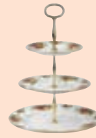
3 Tier Cake Stand 16cm, 20cm, 27cm IOLCOR 00926 798901569039