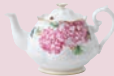
Teapot 1.25ltr Friendship 40001822 701587018821