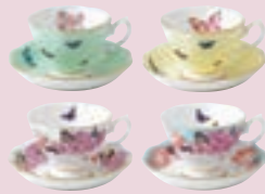
Teacups & Saucers Set of 4 40002650 701587146807