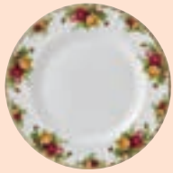
Plate 27cm IOLCOR 00100 798901568018