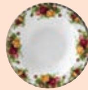
Rim Soup 21cm IOLCOR 00113 798901568117