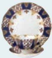
Regency Blue 1900 Teacup & Saucer, Plate 20cm 40017566 701587269421