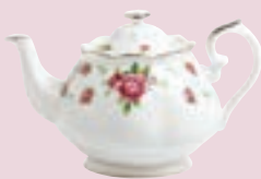
Country Roses White Teapot 1.25ltr NCRWTW25817 652383736887