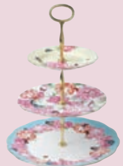
3 Tier Cake Stand 40001833 701587018937