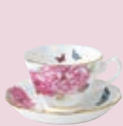
Teacup & Saucer Friendship 40001820 701587018807