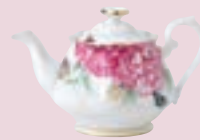
Teapot 0.45ltr 40005765 701587181150