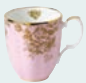
Golden Roses 1960 Mug 0.4ltr 40017594 701587269698