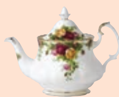
Teapot L/S 1.25Ltr IOLCOR 00145 798901568285