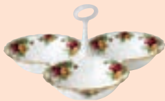
Divided Tray 13cm 40001850 701587018630