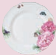
Plate 27cm Friendship 40001557 701587016179