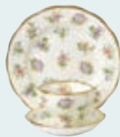
Spring Meadow 1920 Teacup & Saucer, Plate 20cm 40017588 701587269636