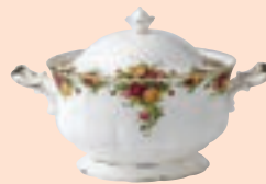
Soup Tureen 3.5Ltr IOLCOR 00468 798901568650