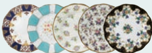
1900-1940 Plate 20cm Box Set of 5 40017560 701587269377