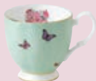
Mug 0.3ltr Blessings 40005766 701587181167