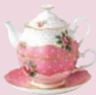
Cheeky Pink Tea For One Boxed CHEPNK26585 652383749924