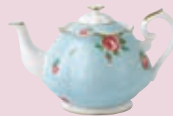
Polka Blue Teapot 1.25ltr POLBLU25817 652383736962