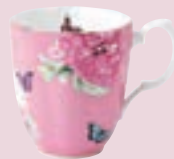
Mug 0.4ltr Pink Friendship 40001828 701587018883