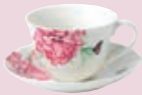
Teacup & saucer White 40033985 701587396264