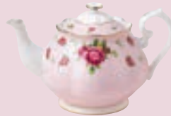
Country Roses Pink Teapot 1.25ltr NCRPNK25817 652383736801