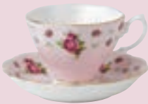
Country Roses Pink Teacup & Saucer Boxed NCRPNK26135 652383739376