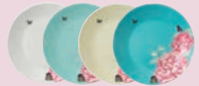
Plates 20cm Mixed set of 4 40033970 701587395915