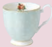
Polka Rose Footed Mug 0.3ltr Boxed 40002393 701587144421