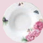
Rim Soup 24cm Friendship 40010649 701587231206