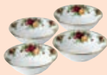
New Bowls 4 Piece Set 16cm 1051424 701587427555