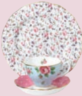
3 Piece set, Teacup, Saucer & Plate – Polka Blue, Cheeky Pink & Rose Confetti 40034971 701587412421