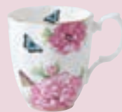
Mug 0.4ltr White Friendship 40001829 701587018890