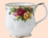
Montrose Mug 0.25Ltr IOLCOR 00042 798901567714