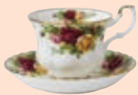
Teacup & Saucer Boxed IOLCOR 04698 798901569183