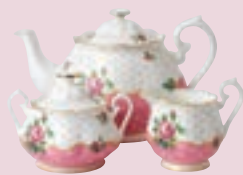
Cheeky Pink 3 Pce Set Teapot, Sugar & Cream 40002392 701587144414