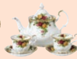
Tea for Two, 5 Piece set 40034978 701587412490