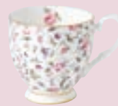
Rose Confetti Footed Mug 0.3ltr Boxed 40002398 701587144476