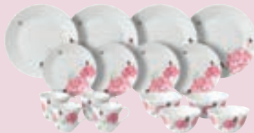
16 Piece Set White (4 x Plate 27cm, Plate 20cm, Cereal Bowl, Mug) 40034013 701587396547