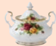
Covered Sugar 0.27Ltr IOLCOR 00161 798901568407