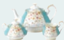
Mint Deco 1930 3 Pce Set Teapot, Sugar & Cream 40034020 701587396615