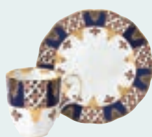
Mug and Plate 20cm Regency Blue 40035587 701587003674