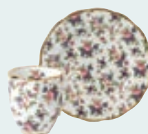
Mug and Plate 20cm English Chintz 40035588 701587003681