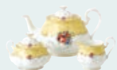
Bouquet 1990 3 Pce Set Teapot, Sugar & Cream 40034015 701587396561