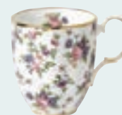
English Chintz 1940 Mug 0.4ltr 40017578 701587269544