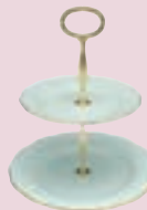
Polka Rose Two Tier Cake Stand Boxed POLROS25866 652383736344