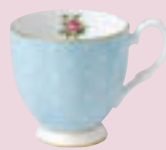
Polka Blue Footed Mug 0.3ltr Boxed 40002394 701587144438