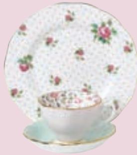
3 Piece set, Teacup, Saucer & Plate – Rose Confetti, Polka Rose, Cheeky Pink 40034972 701587412438