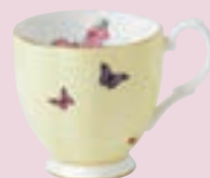
Mug 0.3ltr Joy 40005769 701587181198