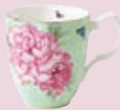
Mug 0.4ltr Green Friendship 40001827 701587018876