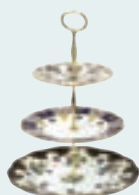
3 Tier Cakestand English Chintz, Regency & Duchess 40034003 701587396448