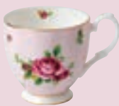
Country Roses Pink Footed Mug 0.3ltr Boxed 40002397 701587144469