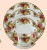
20 Pce Set: 4 x Plate 27cm, 4 x Plate 20cm, 4 x Plate 16cm, 4 x Teacup & Saucer IOLCOR 00840 798901568858