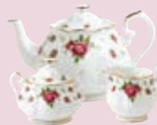
Country Roses White 3 Pce Set Teapot, Sugar, Creamer NCRWTW25823 652383739222