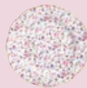
Rose Confetti Plate 20cm Roscon25811 65233837099