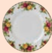
Plate 20cm IOLCOR 00102 798901568025