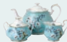
Festival 1950 3 Pce Set Teapot, Sugar & Cream 40017602 701587269773