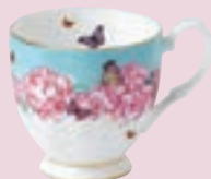
Mug 0.3ltr Devotion 40005767 701587181174