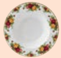
Rim Soup 24cm IOLCOR 00112 798901568100