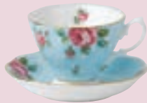
Polka Blue Teacup & Saucer Boxed POLBLU26135 652383739451