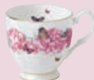
Mug 0.3ltr Gratitude 40005768 701587181181