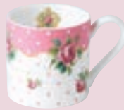
Cheeky Pink Modern Mug 0.35ltr Boxed CHEPNK26578 652383749856