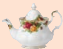
Teapot M/S 0.8Ltr IOLCOR 00192 798901568544