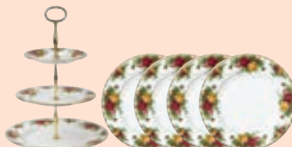
New 4 x Plate 20cm, 1 x 3 Tier Cake Stand, 1051423 701587427548