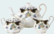
Duchess 1910 3 Pce Set Teapot, Sugar & Cream 40017597 701587269728