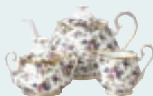
English Chintz 1940 3 Pce Set Teapot, Sugar & Cream 40017572 701587269483