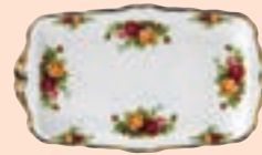
Sandwich Tray 30x17.5cm IOLCOR 00070 798901567875