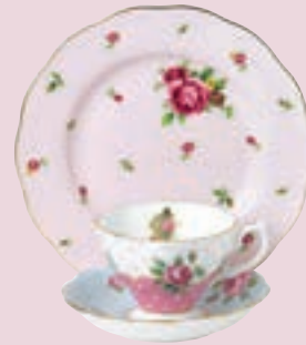
3 Piece set, Teacup, Saucer & Plate – Cheeky Pink, Polka Blue, NCR 40034973 701587412445