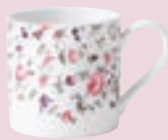
Rose Confetti Modern Mug 0.35ltr Boxed ROSCON25842 652383736078