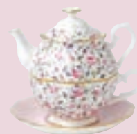
Rose Confetti Tea For One 0.49ltr 40002399 701587144483