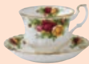
Teacup 0.20Ltr IOLCOR 00130 798901568155