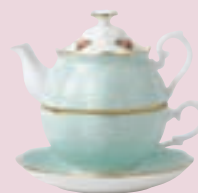
Polka Rose Tea For One POLROS12829 652383744059