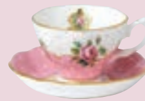
Cheeky Pink Teacup & Saucer Boxed CHEPNK26581 652383749887