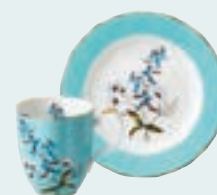
Mug and Plate 20cm Festival 40035849 701587013680