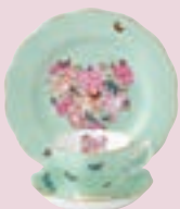
3 Pce Set Teacup, Saucer, Plate 20cm Blessings 40001837 701587018975