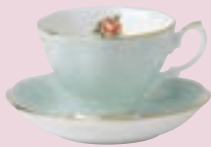
Polka Rose Teacup & Saucer Boxed POLROS26135 652383739499