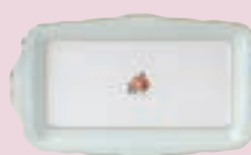
Polka Rose Sandwich Tray Boxed POLROS26137 652383739512