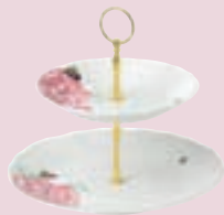
2 Tier Cake Stand – 27cm/20cm White 40034010 701587396516