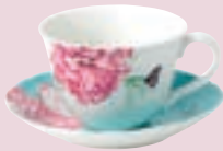
Teacup & saucer Blue 40033988 701587396295