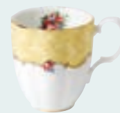
Bouquet 1990 Mug 0.4ltr 40017558 701587269353