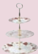
Country Roses White Three Tier Cake Stand Boxed NCRWTW25867 652383736474