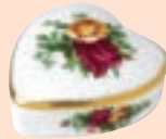
Heart Box 40001859 701587019125