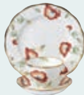
Poppy 1970 Teacup & Saucer, Plate 20cm 40017570 701587269469