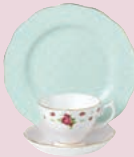
3 Piece set, Teacup, Saucer & Plate – NCR White, Rose Confetti, Polka Rose 40034974 701587412452