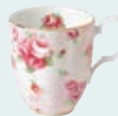
Rose Blush 1980 Mug 0.4ltr 40017556 701587269339