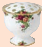
Rose Bowl 14cm 40001851 701587018647