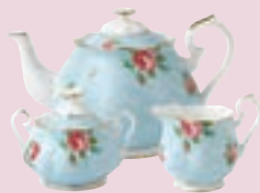
Polka Blue 3 Pce Set Teapot, Sugar, Creamer POLBLU25823 652383739260