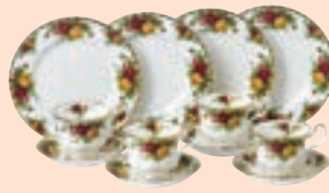
12 Piece Tea Entertaining Set 40035301 701587415781