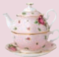
Country Roses Pink Tea For One 0.49ltr 40002520 701587144490