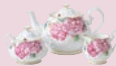
Teapot, Sugar Cream Friendship 40001821 701587018814