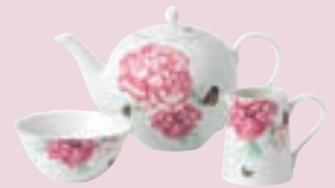
Teapot, Sugar & Cream White 40034006 701587396479