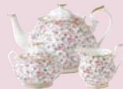
Rose Confetti 3 Pce Set Teapot, Sugar, Creamer ROSCON25823 652383739338