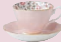
Rose Confetti Teacup & Saucer Boxed ROSCON26135 652383739628