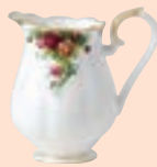
Jug 40001857 701587019101