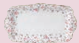
Rose Confetti Sandwich Tray Boxed ROSCON26137 652383739642