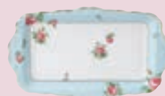
Polka Blue Sandwich Tray Boxed POLBLU26137 652383739475