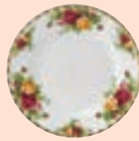
Plate 18cm IOLCOR 00093 798901567998