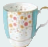
Mint Deco 1930 Mug 0.4ltr 40017554 701587269315