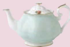
Polka Rose Teapot 1.25ltr POLROS25817 652383737044