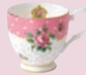
Cheeky Pink Footed Mug 0.3ltr Boxed 40002395 701587144445