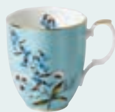
Festival 1950 Mug 0.4ltr 40017593 701587269681