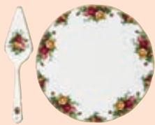
Tea Cake Plate & Server 40001863 701587019163