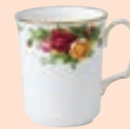
Beaker 0.25Ltr IOLCOR 00004 798901567592