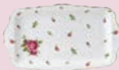
Country Roses White Sandwich Tray Boxed NCRWTW26137 652383739437