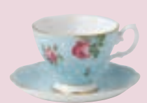
Polka Blue Espresso Cup & Saucer Boxed POLBLU26136 652383739468