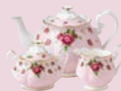
Country Roses Pink 3 Pce Set Teapot, Sugar, Creamer NCRPNK25823 652383739185