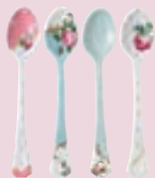
Set 4 Ceramic Spoons Boxed 40000655 701587005951