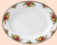
Oval Dish 38cm IOLCOR 00108 798901568063