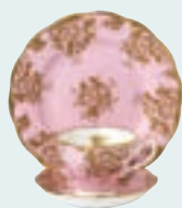
Golden Rose 1960 Teacup & Saucer, Plate 20cm 40017590 701587269650