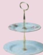
Polka Blue Two Tier Cake Stand Boxed POLBLU25866 652383736214