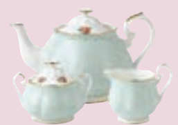
Polka Rose 3 Pce Set Teapot, Sugar, Creamer POLROS25823 652383739307