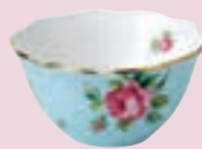
Polka Blue Ice Cream Bowl Boxed 40000657 701587005975