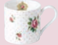
Pink Roses Modern Mug 0.35ltr Boxed CHEPNK26579 652383749863