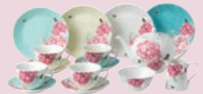
15 Piece Set Mixed Colours – (4 x Plate 20cm, Teacup & Saucers, Teapot, Sugar & Cream) 40034018 701587396592