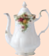
Coffee Pot L/S 1.25Ltr IOLCOR 00141 798901568247