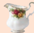
Cream Jug 0.25Ltr IOLCOR 00134 798901568193