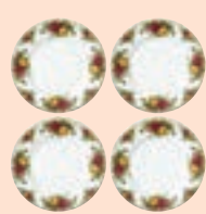
Plates 20cm, Set of 4 40034980 701587412513