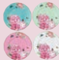
Accent Plates Friendship Set of 4 40001825 701587018852