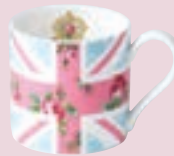
Union Jack Modern Mug 0.35ltr Boxed CHEPNK26580 652383749870