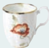
Poppy 1970 Mug 0.4ltr 40017580 701587269568