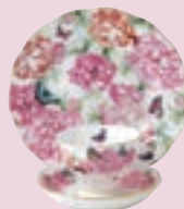
3 Pce Set Teacup, Saucer, Plate 20cm Gratitude 40001839 701587018999