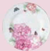
Plate 20cm Friendship 40001558 701587016186