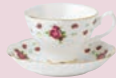
Country Roses White Teacup & Saucer Boxed NCRWTW26135 652383739413