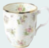
Spring Meadow 1920 Mug 0.4ltr 40017592 701587269674