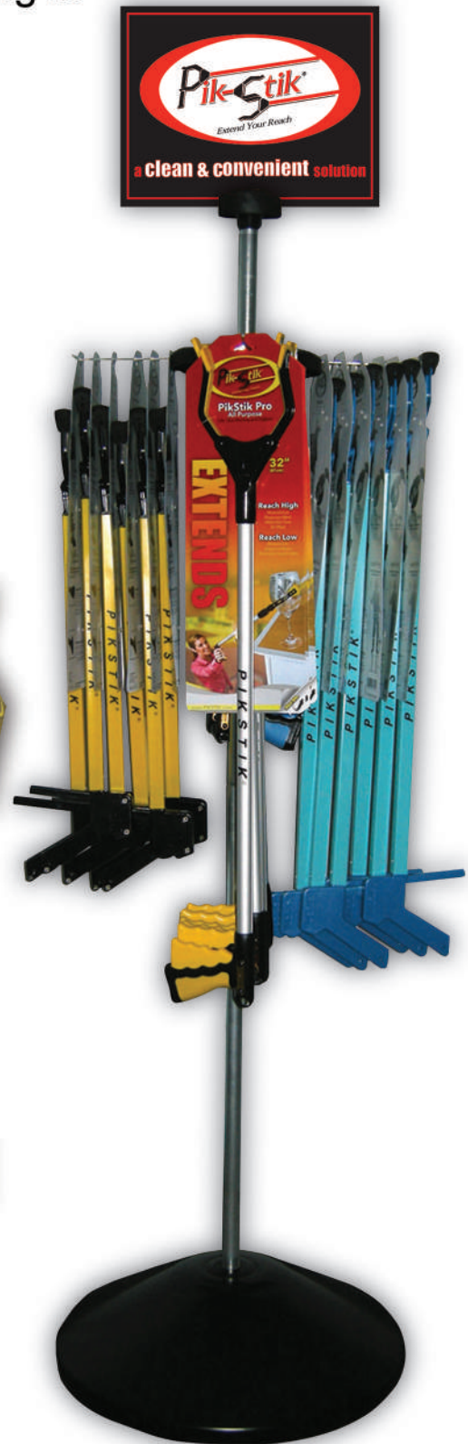
PikStik Spinning Floor Display PikStik TrashStik Floor Display