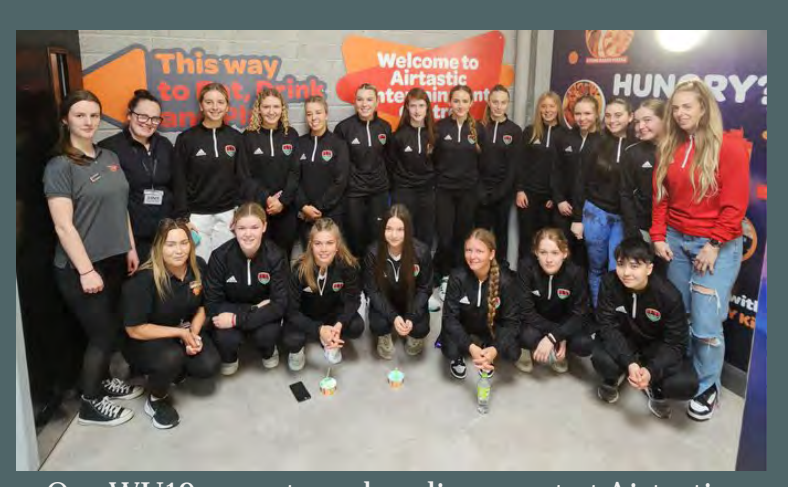
Our WU19s on a team bonding event at Airtastic, Little Island