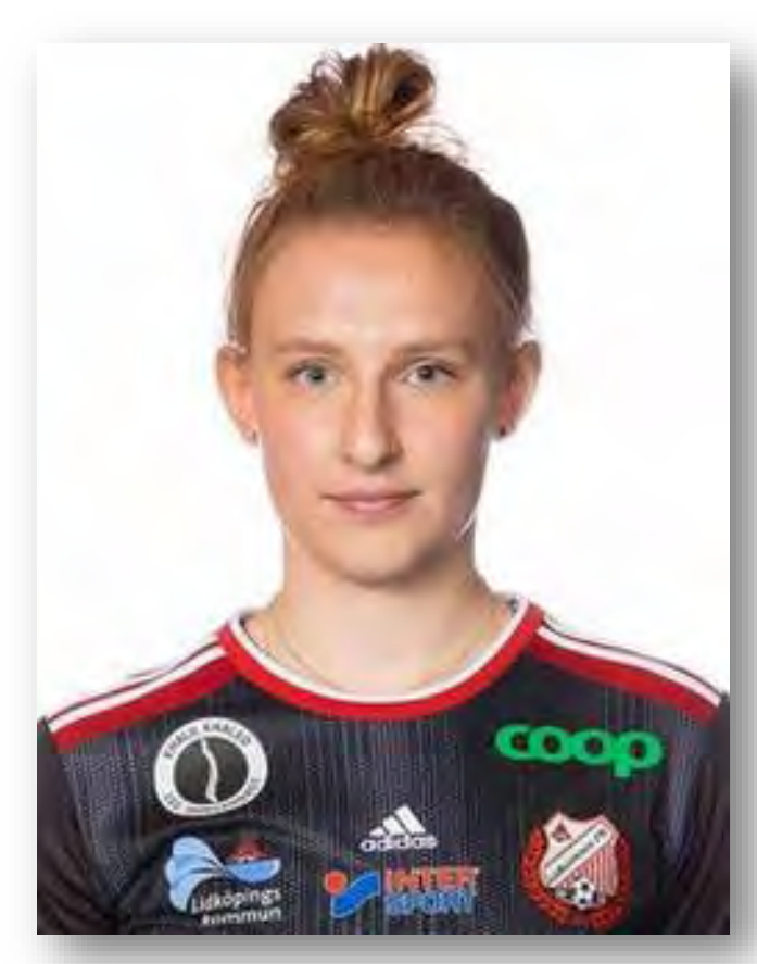
Doro at Lidköpings FK, Sweden

Coming to City "happened really fast. I was playing in Sweden up until last December and I knew I wanted to go to a different country, but I didn't know where."