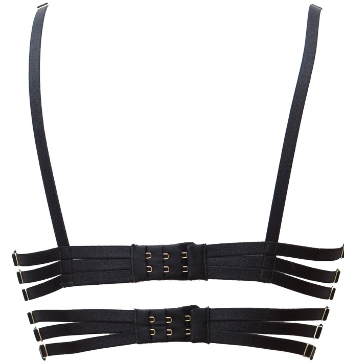
Longline bra back adjustable strapping