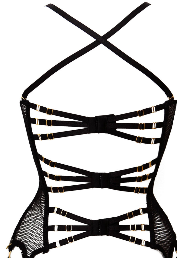
Quarter cup basque adjustable back strapping