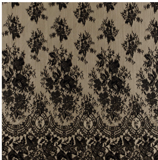
'Victoria' leavers lace in black