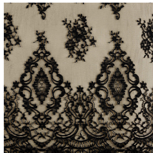
'Miroir' French chantilly lace