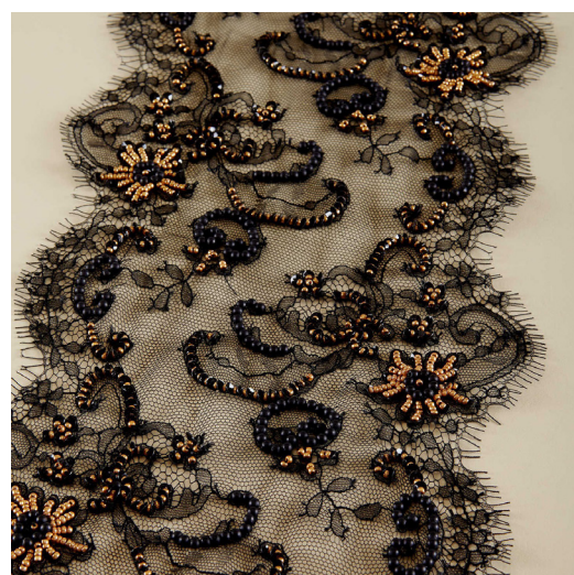
'Légèreté nacrée' hand beaded lace in black/gold