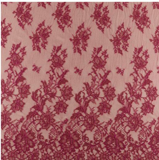
'Grimpante' leavers lace in 'Rose'