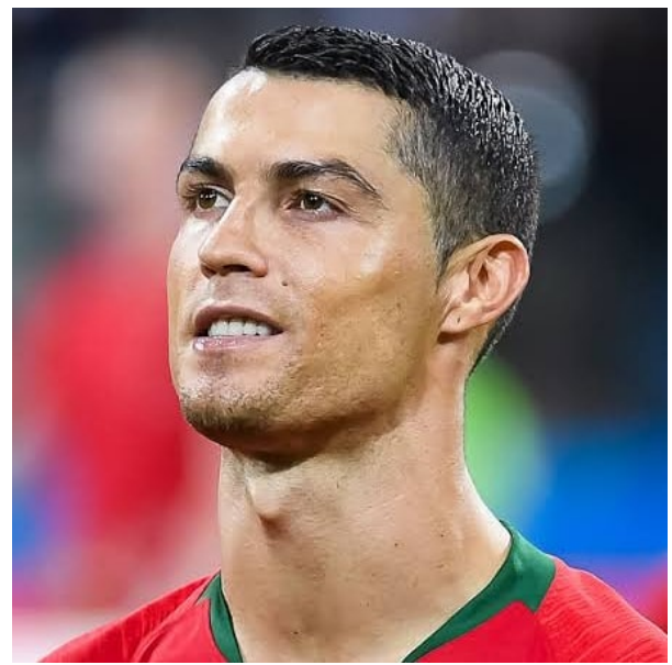
#fitness #fitnesslovers #fitnessgirl #fitlife #fitlovers #calistenichs #growth #motivation #gym #motivasyon #nopainnogain #nevergiveup #aestetichlife #bodybulding #bodybuildinglifestyle #fittness #fitbody #body #nutrition #eating #beslenme #diet #bulk #definasyon #definition #beast #hard #training #sixpack #biceps