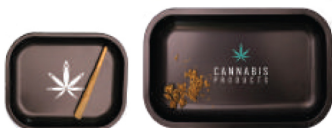
SMALL 7.1" x 5.5"