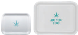
SMALL 7.1" x 5.5"