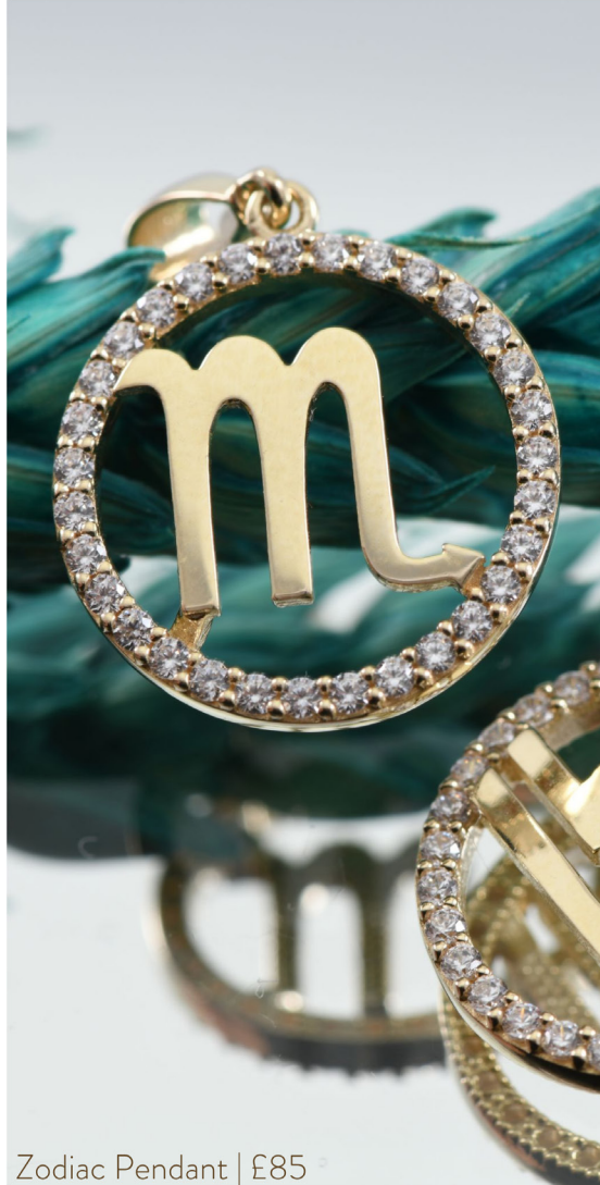
Zodiac Pendant | £85