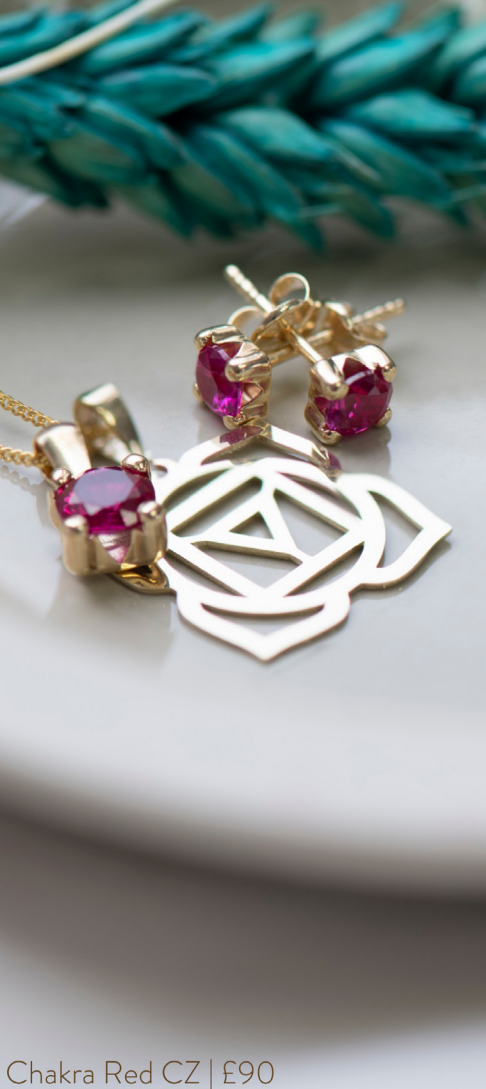
Chakra Red CZ | £90