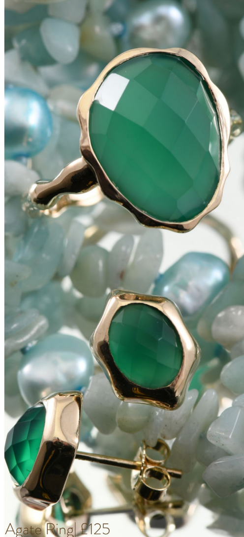
Agate Ring | £125

It's hard to select favourites...but my first pick is the 9ct yellow gold 'Root Chakra' necklace.