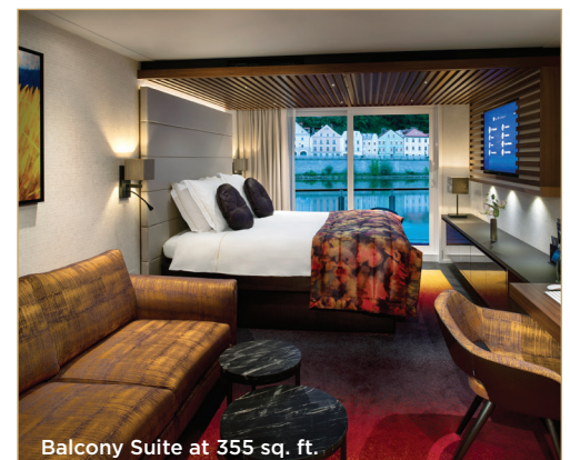
Balcony Suite at 355 sq. ft.