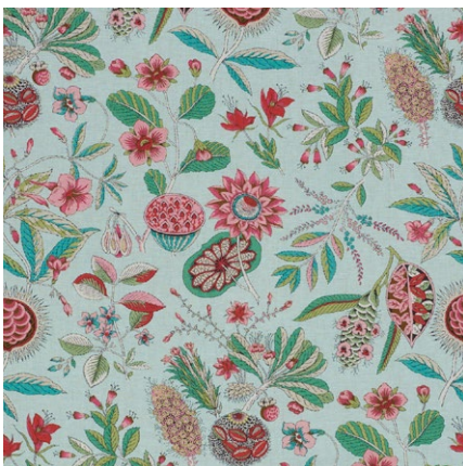
ROCA REDONDA MINERAL & PINK 178770