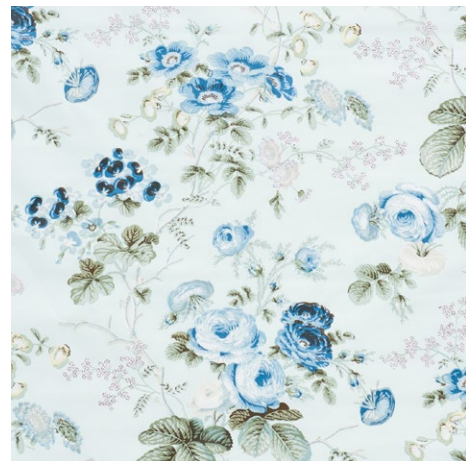
SALISBURY CHINTZ CELADON 178150