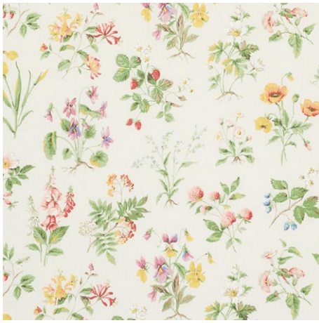
FLOREANA BERRY 178791