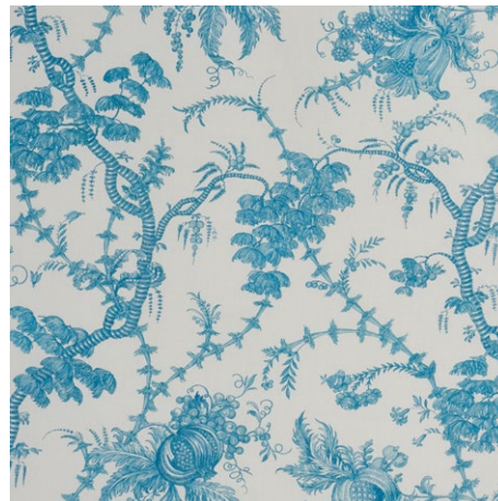
SAN CRISTOBAL TOILE PEACOCK 178731