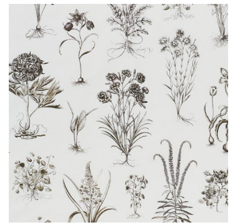
CABOT BOTANICAL IVORY 178751