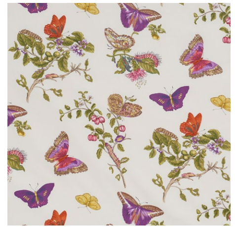
BAUDIN BUTTERFLY CHINTZ PURPLE 178722