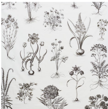
CABOT BOTANICAL LARGE IVORY 178740