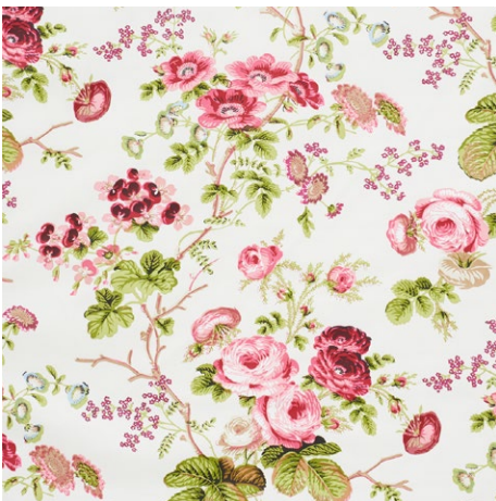
SALISBURY CHINTZ GARNET 178151