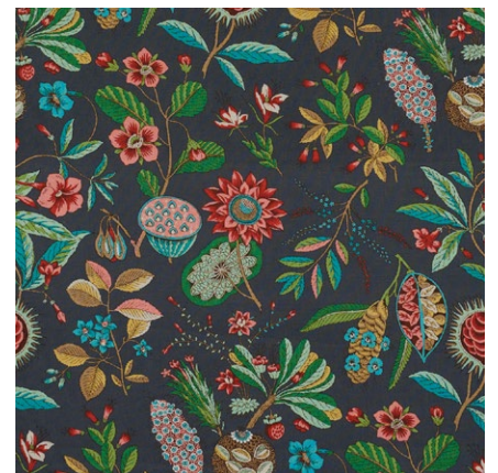
ROCA REDONDA CARBON & MULTI 178772