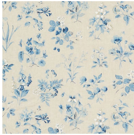
FLOREANA BLUE 178790