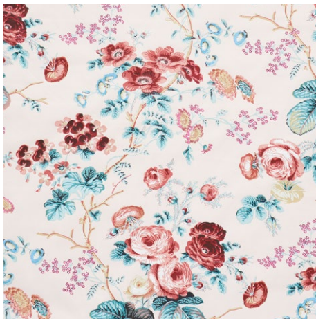
SALISBURY CHINTZ ROSE 178152