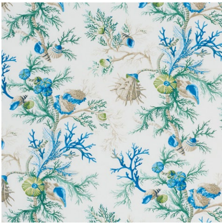
DEL TESORO BLUE & GREEN 178760