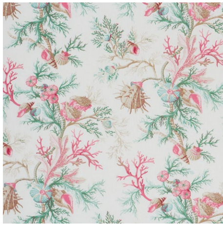
DEL TESORO PINK & AQUA 178761