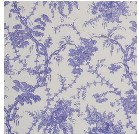
SAN CRISTOBAL TOILE PURPLE 178732