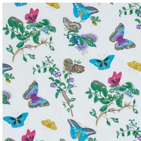
BAUDIN BUTTERFLY CHINTZ TURQUOISE 178721