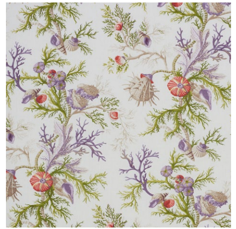
DEL TESORO PURPLE & CORAL 178762