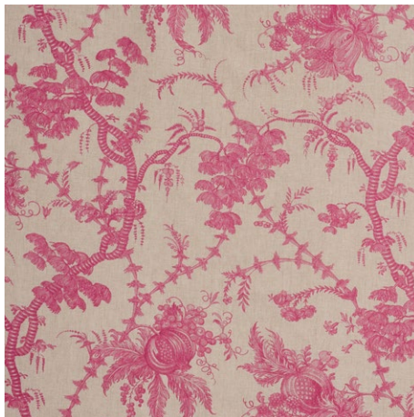
SAN CRISTOBAL TOILE MAGENTA 178730