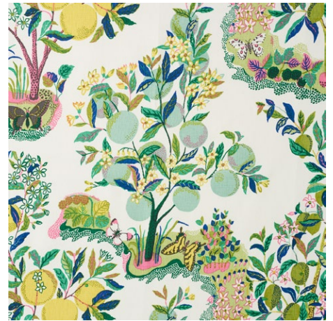
CITRUS GARDEN LIME 175762