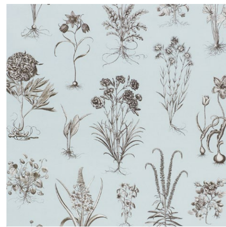
CABOT BOTANICAL SKY 178750