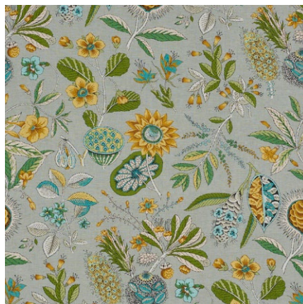
ROCA REDONDA GREY & OCHRE 178771