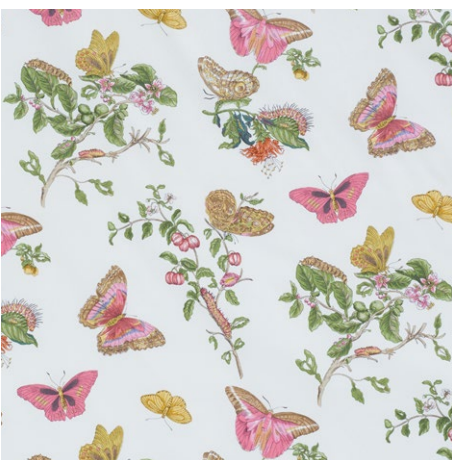
BAUDIN BUTTERFLY CHINTZ BLUSH 178720