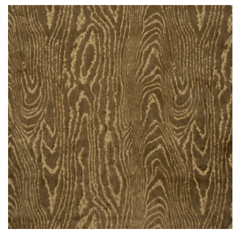
MARISA MOIRE VELVET CAMEL 82750 Fabric