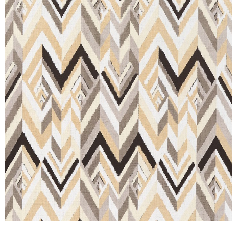
TAYLOR VELVET PEBBLE 82741 Fabric