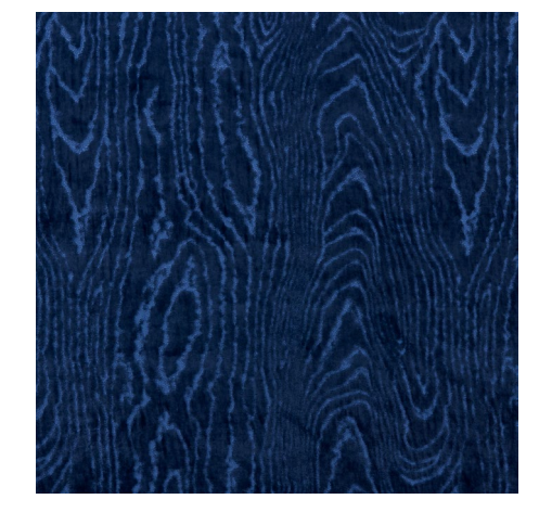
MARISA MOIRE VELVET LAPIS 82752 Fabric