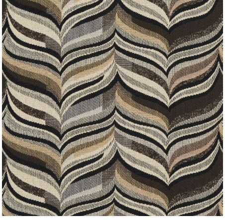
LOULOU SMOKY QUARTZ 82730 Fabric