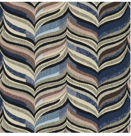
LOULOU OPAL 82731 Fabric