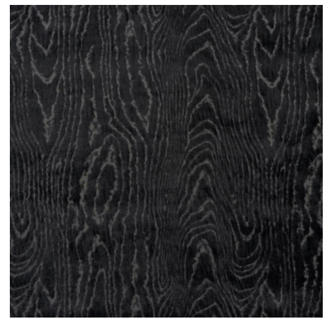
MARISA MOIRE VELVET SMOKE 82751 Fabric