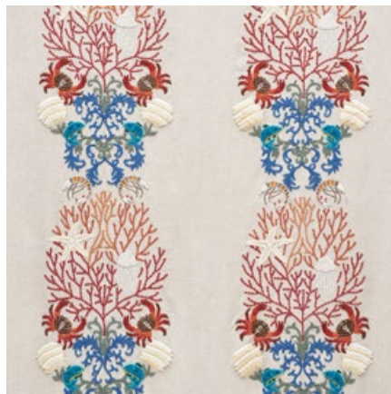
UNDER THE SEA MULTI 73550 FABRIC