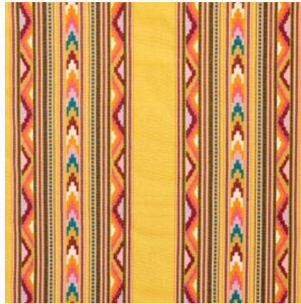
ZARZUELA STRIPE EMBROIDERY SAFFRON 78391 FABRIC