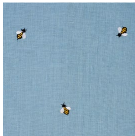
HONEY BEE EMBROIDERY SKY 78421 FABRIC