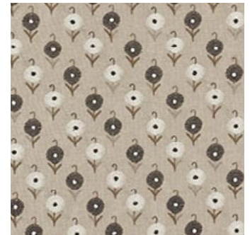
AVODICA EMBROIDERY MOONSTONE 70212 FABRIC