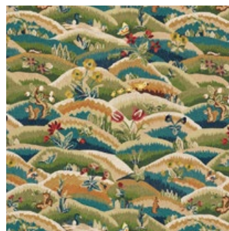
GERRY EMBROIDERY DOCUMENT 72450 FABRIC