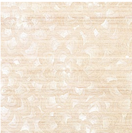
LOTUS EMBROIDERY SISAL IVORY 5011210 WALLCOVERING