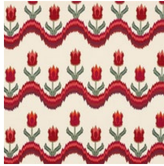
TULIP FLAMESTITCH EMBROIDERY VERMILION 70271 FABRIC