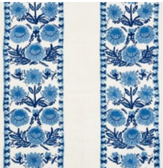
MARGUERITE EMBROIDERY SKY 72330 FABRIC