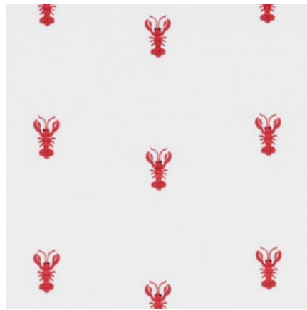
LOBSTER EMBROIDERY WHITE 78801 FABRIC