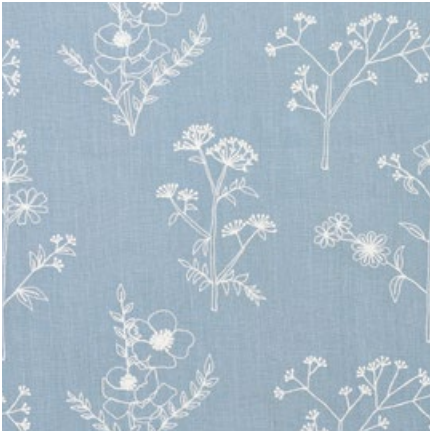
LISBETH EMBROIDERY BLUE 78360 FABRIC