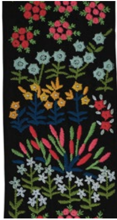
LULA EMBROIDERED TAPE MULTI ON BLACK 79310