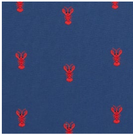
LOBSTER EMBROIDERY NAVY 78800 FABRIC