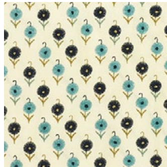
AVODICA EMBROIDERY AEGEAN 70210 FABRIC