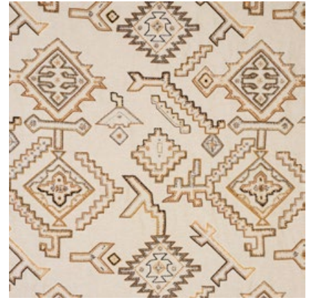
EZMA EMBROIDERY NEUTRAL 78380 FABRIC