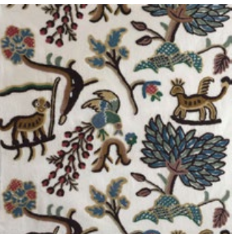
COLONIAL CREWEL DOCUMENT 3135012 FABRIC