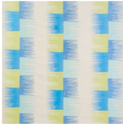
SUNBURST STRIPE EMBROIDERY BLUE & LIME 78401 FABRIC