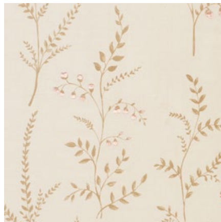
CYNTHIA EMBROIDERED PRINT NATURAL 78351 FABRIC