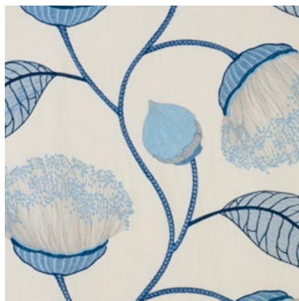
CELINDA EMBROIDERY BLUE 78301 FABRIC