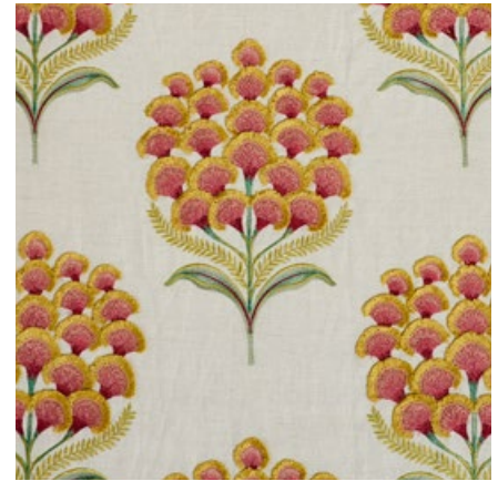
AURELIA EMBROIDERY NATURAL 78812 FABRIC