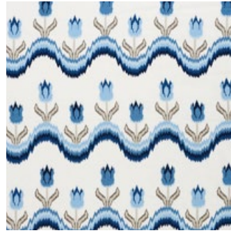
TULIP FLAMESTITCH EMBROIDERY BLUE 70272 FABRIC