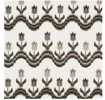
TULIP FLAMESTITCH EMBROIDERY QUARRY 70273 FABRIC