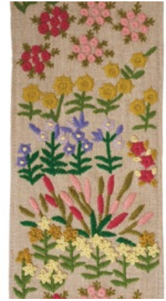
LULA EMBROIDERED TAPE MULTI ON NATURAL 79312