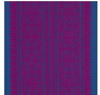
TOLEDO CASBAH 69732 FABRIC