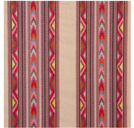
ZARZUELA STRIPE EMBROIDERY MULTI 78392 FABRIC