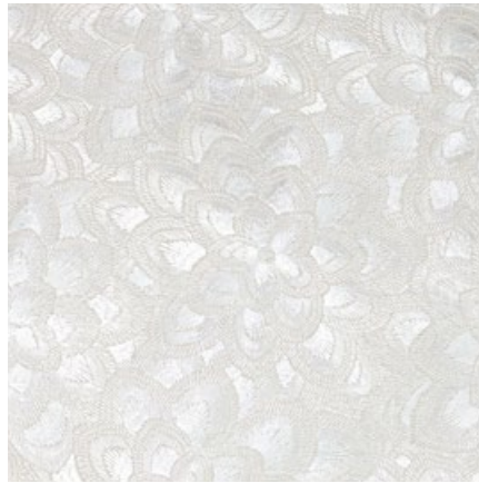
LOTUS EMBROIDERY PEARL 78341 FABRIC