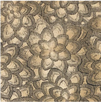
LOTUS EMBROIDERY GOLD 78340 FABRIC