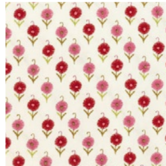
AVODICA EMBROIDERY AZALEA 70211 FABRIC