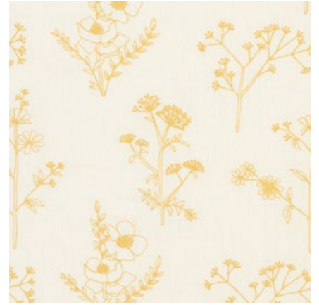
LISBETH EMBROIDERY MARIGOLD 78362 FABRIC