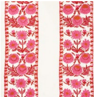
MARGUERITE EMBROIDERY BLOSSOM 72331 FABRIC