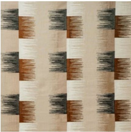
SUNBURST STRIPE EMBROIDERY BLACK & NEUTRAL 78400 FABRIC