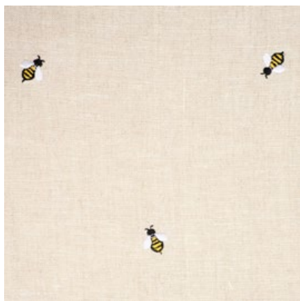
HONEY BEE EMBROIDERY NATURAL 78420 FABRIC