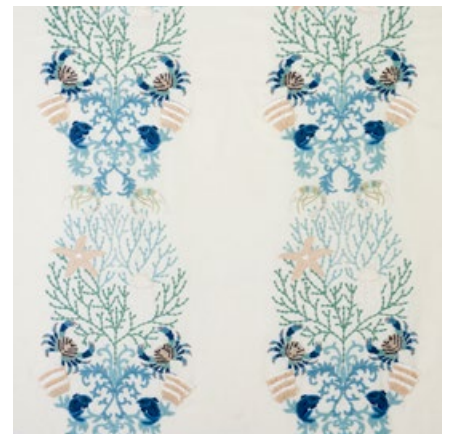
UNDER THE SEA SEAFOAM 73551 FABRIC