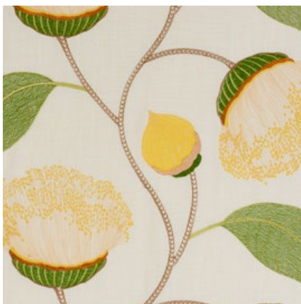
CELINDA EMBROIDERY YELLOW 78300 FABRIC

THE NAME OF THIS COLLECTION SAYS IT ALL! FROM CLASSIC CHAIN AND SATIN STITCHES TO FRENCH KNOTS AND HAND-CLIPPED FRINGES, OUR NEW EXQUISITE EMBROIDERIES COLLECTION SHOWCASES AN ASTONISHING ARRAY OF EMBROIDERY TECHNIQUES AND REINFORCES SCHUMACHER'S COMMITMENT TO ARTISANAL TEXTILES AND THE UNIQUE CHARACTER OF HANDCRAFTED DESIGNS.