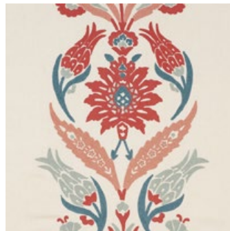
ANAGADA EMBROIDERY DUSTY ROSE 74140 FABRIC