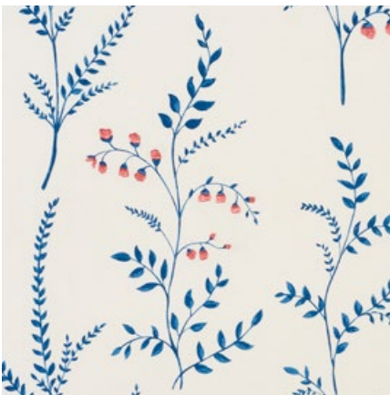
CYNTHIA EMBROIDERED PRINT BLUE 78350 FABRIC