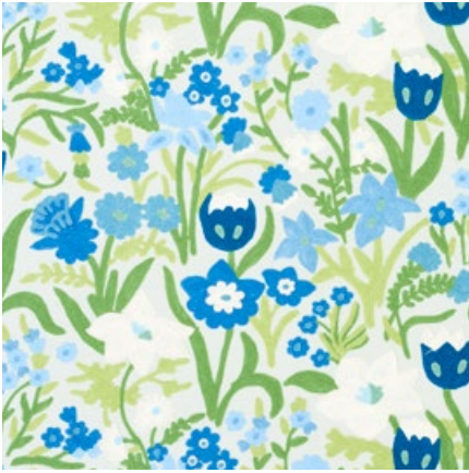
CREWEL GARDEN SKY 78290 FABRIC