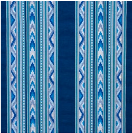
ZARZUELA STRIPE EMBROIDERY INDIGO 78390 FABRIC