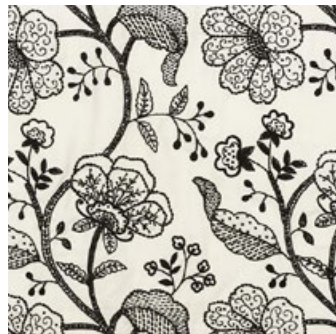
FULL BLOOM EMBROIDERY INK 70812 FABRIC