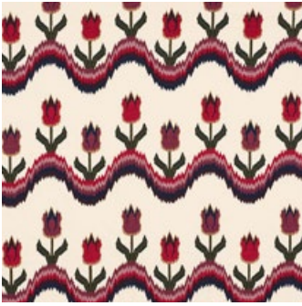
TULIP FLAMESTITCH EMBROIDERY JEWEL 70270 FABRIC