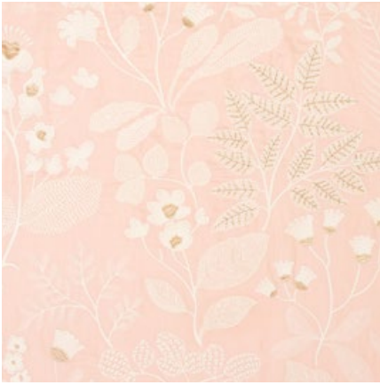
EMALINE EMBROIDERY BLUSH 78310 FABRIC