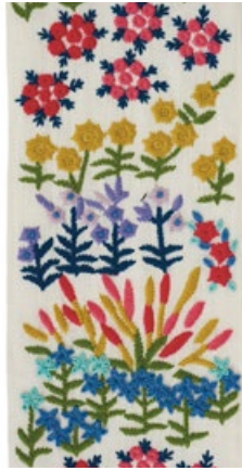
LULA EMBROIDERED TAPE MULTI ON WHITE 79311