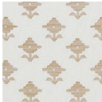
RUBIA EMBROIDERY IVORY 74160 FABRIC