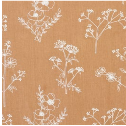
LISBETH EMBROIDERY CAMEL 78361 FABRIC