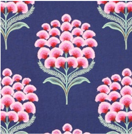
AURELIA EMBROIDERY NAVY 78810 FABRIC