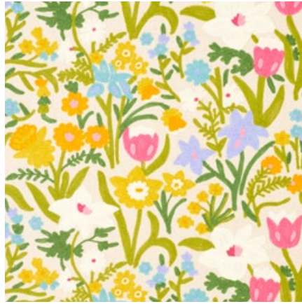
CREWEL GARDEN MULTI 78291 FABRIC