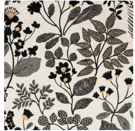
EMALINE EMBROIDERY BLACK 78312 FABRIC