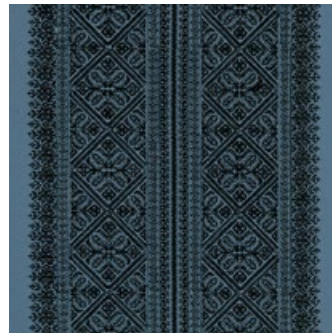
TOLEDO MIDNIGHT 69731 FABRIC