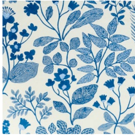
EMALINE EMBROIDERY BLUE 78311 FABRIC