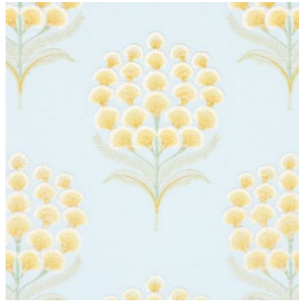
AURELIA EMBROIDERY SKY 78811 FABRIC