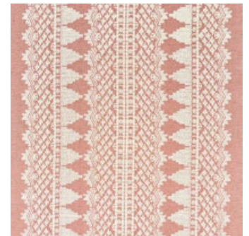
WENTWORTH EMBROIDERY ROSE 75473 FABRIC