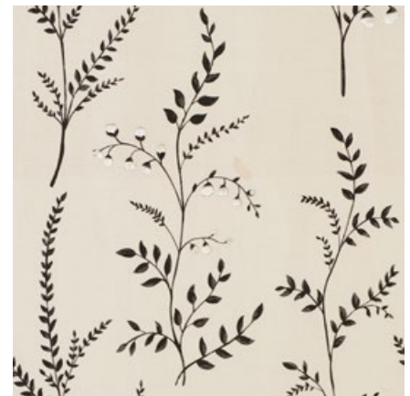
CYNTHIA EMBROIDERED PRINT BLACK 78352 FABRIC