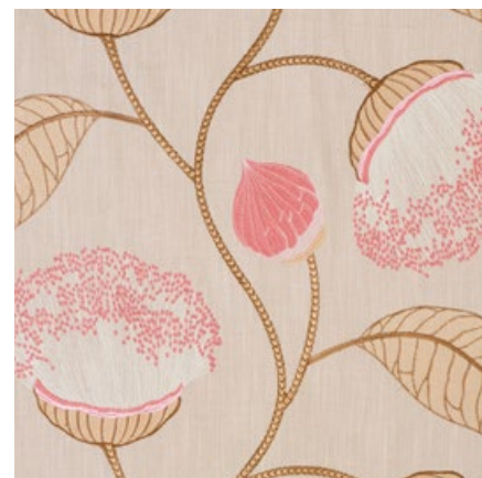
CELINDA EMBROIDERY BLUSH 78302 FABRIC