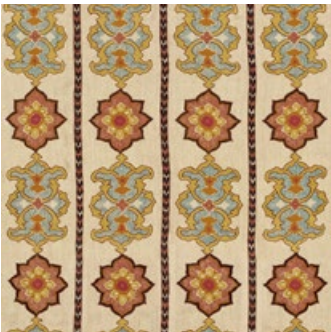
TEMARA EMBROIDERED PRINT SPICE 175181 FABRIC