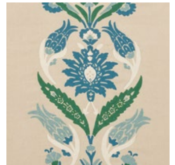
ANAGADA EMBROIDERY PEACOCK 74141 FABRIC