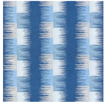
SUNBURST STRIPE EMBROIDERY BLUES 78402 FABRIC