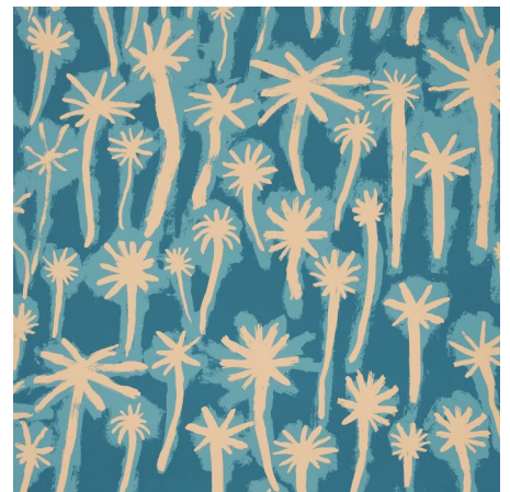
PALMITAS Bahama 5014601 Wallcovering