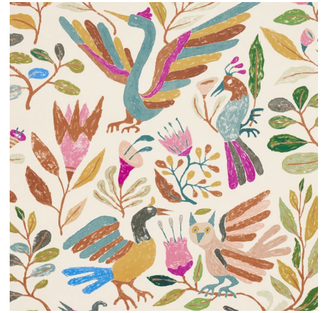
CANOPY Multi Birds 5014831 Wallcovering