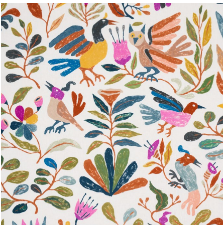
CANOPY Multi Birds 180850 Fabric