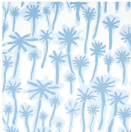
PALMITAS Mist 5014602 Wallcovering