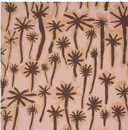
PALMITAS Coral 5014600 Wallcovering