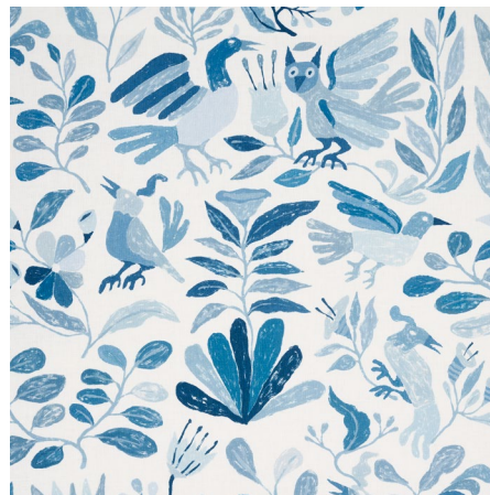
CANOPY Blue Birds 180851 Fabric