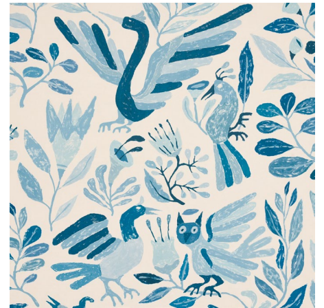
CANOPY Blue Birds 5014830 Wallcovering