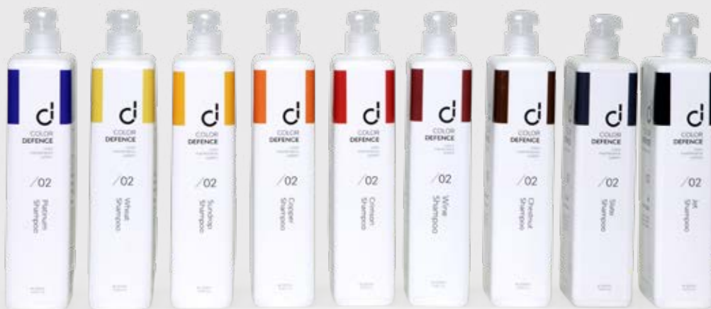
Colour Depositing Shampoos