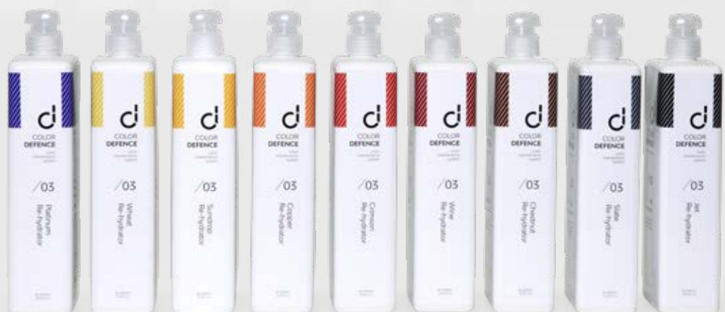
Colour Depositing Rehydrators